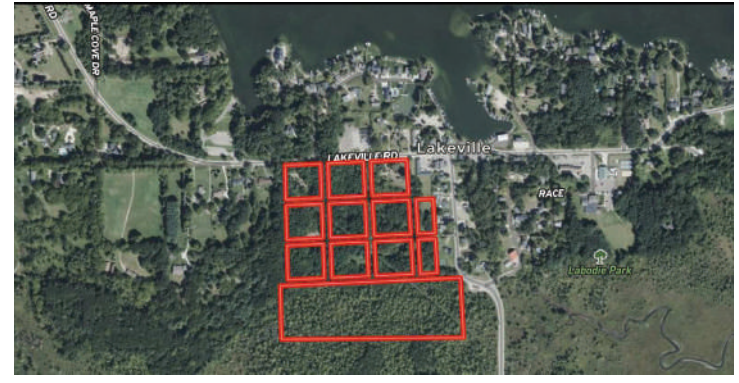
MAP LOCATION AND BOUNDARIES ARE ONLY APPROXIMATE AND MUST BE VERIFIED FOR ACCURACY.