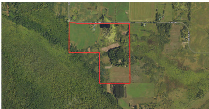
MAP LOCATION AND BOUNDARIES ARE ONLY APPROXIMATE AND MUST BE VERIFIED FOR ACCURACY.