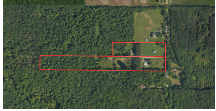
MAP LOCATION AND BOUNDARIES ARE ONLY APPROXIMATE AND MUST BE VERIFIED FOR ACCURACY.